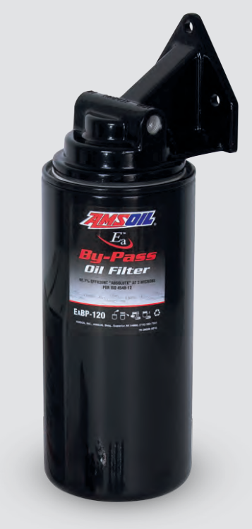
Fittings and hardware not shown

The Heavy-Duty Bypass Filtration System is constructed of high-quality cast aluminum with a steel filter spud that has been thoroughly tested in on-road and severe off-road service. The mount is finished with a thick layer of powder-coated paint to provide maximum resistance to the degrading effects of road salt, debris and engine-compartment chemicals.