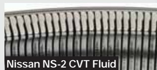
Nissan NS-2 CVT Fluid