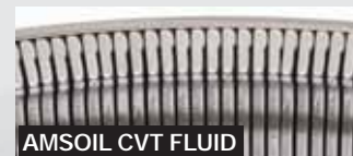
AMSOIL CVT FLUID