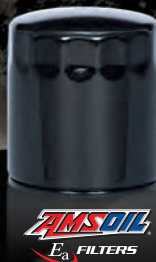
AMSOIL E3 FILTERS