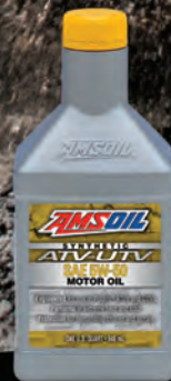
SYNTHETIC MOTOR OIL