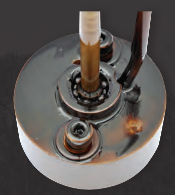
CONVENTIONAL HYDRAULIC OIL (ISO 46)