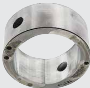
VANE PUMP CAM RING

Order by Phone 1-800-956-5695 - Give Operator Reference #1999441