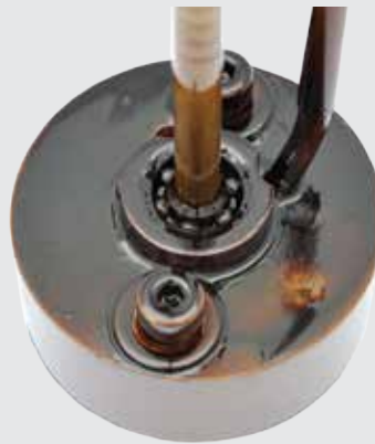
LEADING CONVENTIONAL HYDRAULIC FLUID (ISO 46)