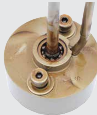
AMSOIL SYNTHETIC MULTI-VISCOSITY HYDRAULIC OIL (ISO 46)