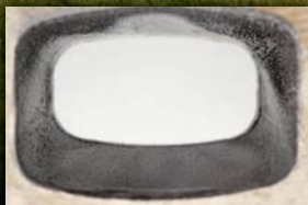
0% Port Blockage

Duluth Lawn Care Services Co. cut its oil costs 65% using SABER Professional at a 100:1 mix ratio versus using Stihl HP Ultra 2-Cycle Oil at 50:1. Plus, SABER Professional delivered clean, protected power for maximum efficiency.