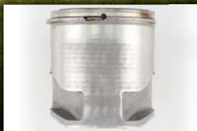
Virtually No Wear/Deposits